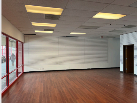
Suite D10 - 2,244 SF