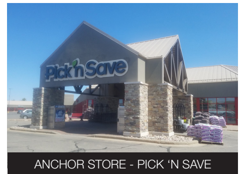
ANCHOR STORE - PICK 'N SAVE