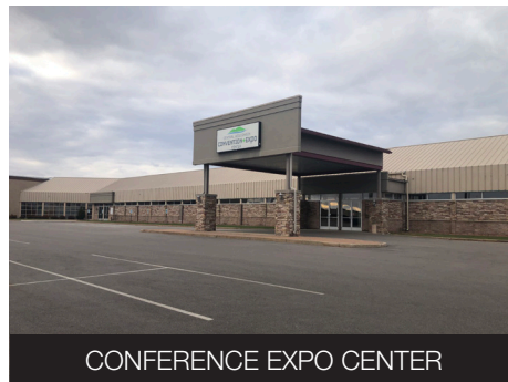
CONFERENCE EXPO CENTER