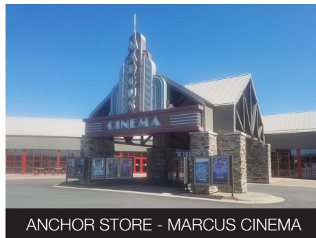
ANCHOR STORE - MARCUS CINEMA