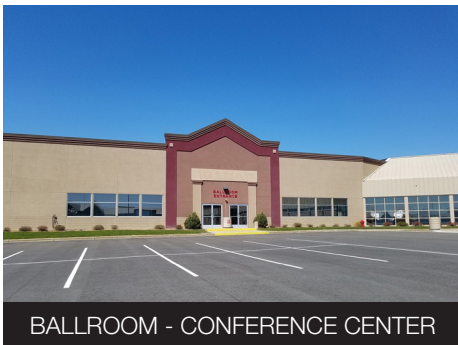
BALLROOM - CONFERENCE CENTER